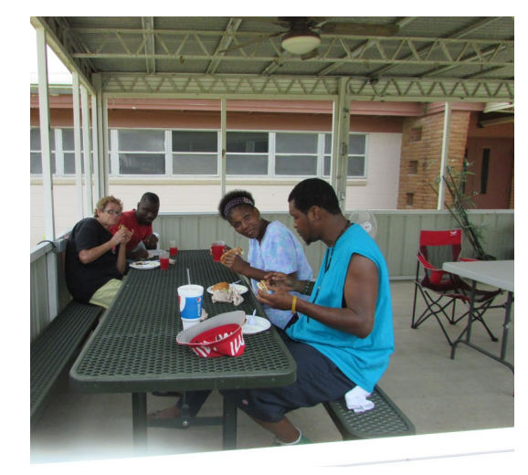
Article & Photos Contributed by: LaWanda Calhoun