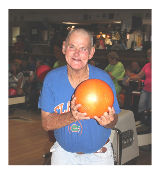
Beating the Heat Bowling & Shooting Hoops!